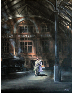
The Merseyside Express

Liverpool Street station was bombed several times during the war. Fortunately the elegant Great Eastern Hotel was not hit and survived its original state well protected by the modernisation of the station complex in the 1970s. The painting shows a soldier from the airborne division (red beret) being greeted by his lady. The clock of number 1 in Liverpool Street were even saved during the blitz, and the couple are highlighted in one, with a K9 in a dispirited state of cleanliness (could be the left being through the soldier home on leave). The atmosphere of Liverpool Street Station remained the same until modernisation and continued as my favourite of all the London stations because of the wonderful display of light and shade, and the cathedral-like architecture.